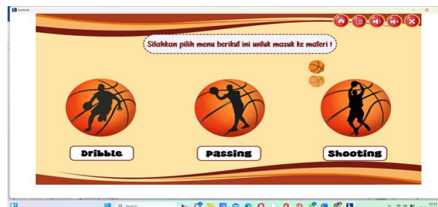
Figure 2. Three basic basketball techniques