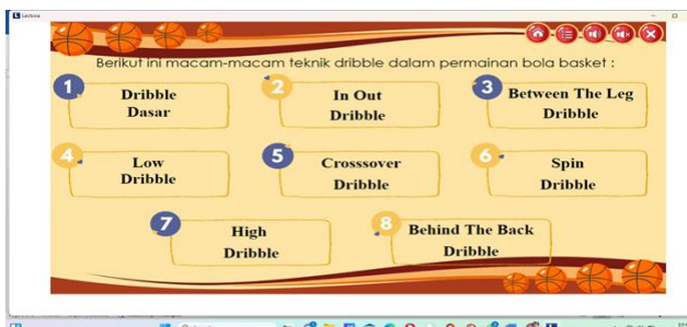
Figure 3. Various types of basketball dribbles