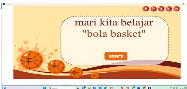
Figure 1. Lectora's main profile

This research aims to develop innovative and effective learning media to improve students' understanding and skills in video-based basketball. Lectora Inspire was chosen as the platform because of its extraordinary ability to integrate multimedia elements such as video, text, audio, and animation, which can enrich the student learning experience. The development of this research using ADDIE was developed using Analysis, Design, Development, Implementation, and Evaluation. After the media is created, it continues with a practicality test. The following is an example of figure 1, 2, 3, and 4.