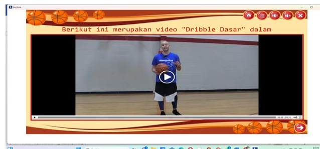
Figure 4. Basketball dribbling video

As shown by several Figures displayed above which show the various menus available during development, starting with introduction, materials, developer profile, and learning videos. In addition, in the material menu, students can find theoretical material to improve their knowledge of theory and to better understand basic basketball techniques in practice. Apart from that, there is a learning video menu that combines several theories that have been presented in the material menu. For this reason, the Lectora Inspire practicality test was carried out on students using a questionnaire.