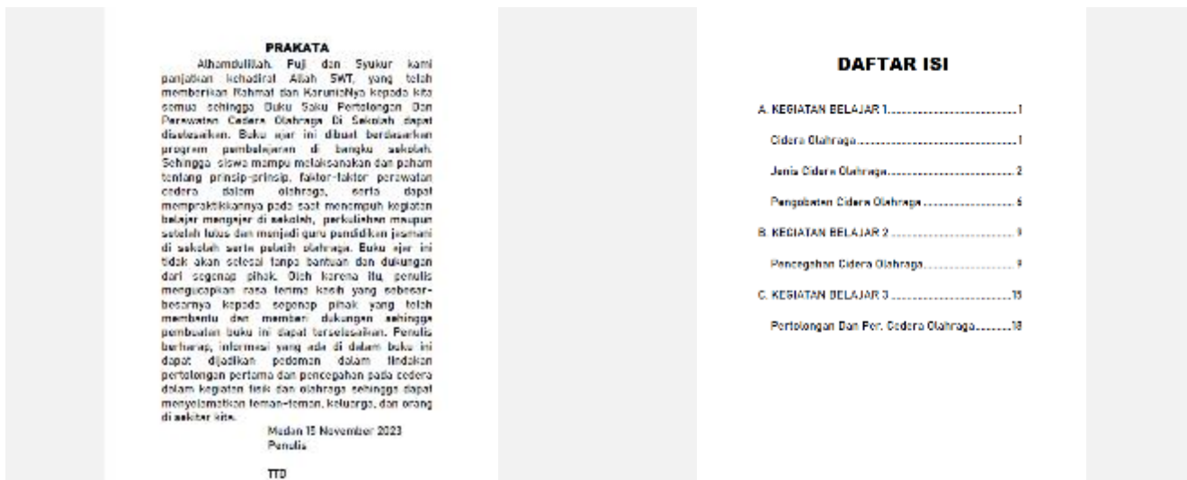
Figure 3. Preface and table of contents