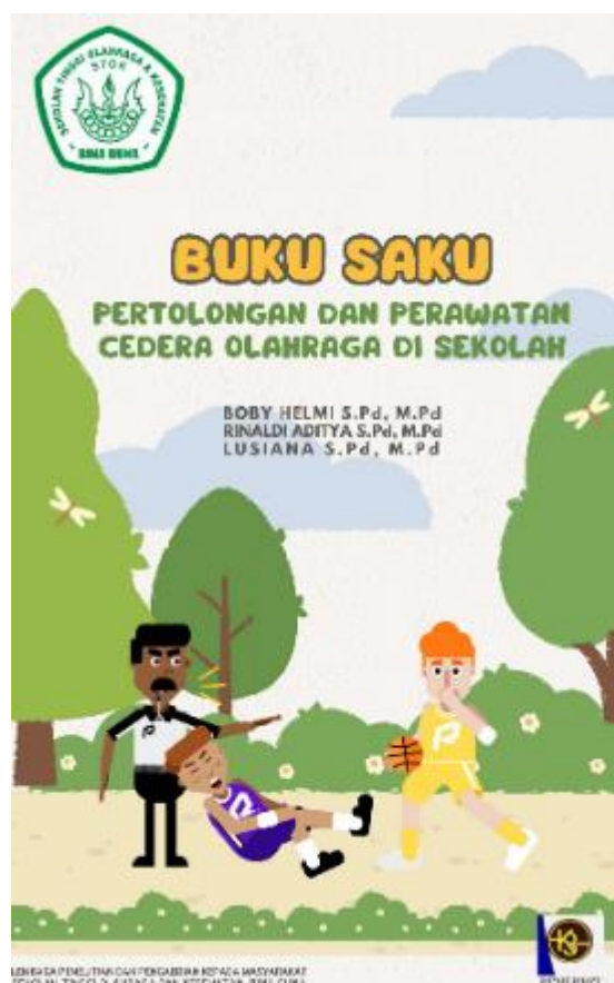
Figure 2. Book cover page

The final product of this research can be formulated based on expert input and suggestions as well as the results of the large-scale trial at school. The results are shown below, including: